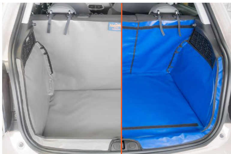
Rear Plus boot liner FLOW-HR2