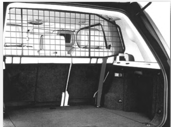
RANGE ROVER DOG GUARD (2 of 2 models)