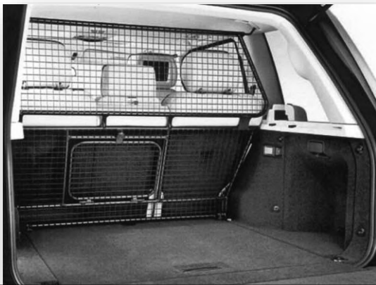
RANGE ROVER DOG GUARD (1 of 2 models)