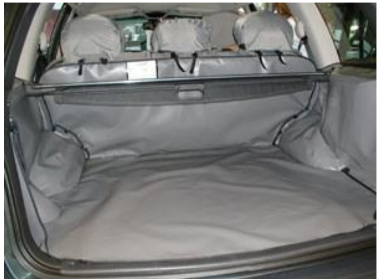
Rear Plus boot liner