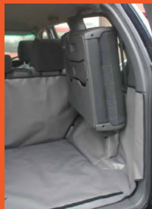
NO SEAT COVERS

A '3RD ROW FOLDED SEAT COVERS' OPTION CAN BE PURCHASED TO PRO- TECT THE FOLDED SEATS