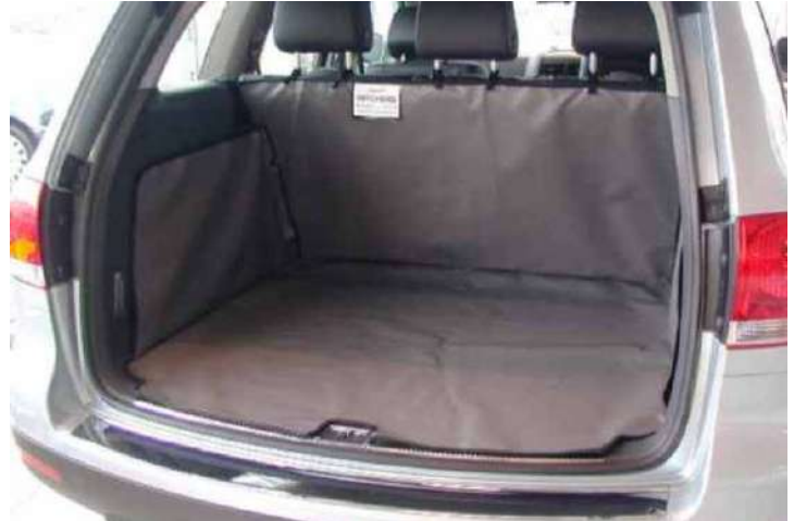
SH1-SUSPNO Plus boot liner