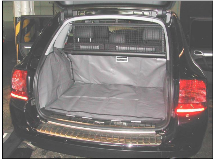
PHOTO SHOWS - NET CASSETTE LEFT IN VERSION

Liners own 2 x foam filled / fastener tabs Minimum of 24 self-adhesive loop fastener tabs Liners own 4 x small hook / loop fastener tabs