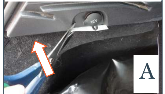
Cutting the strips of loop fastener to aid fit