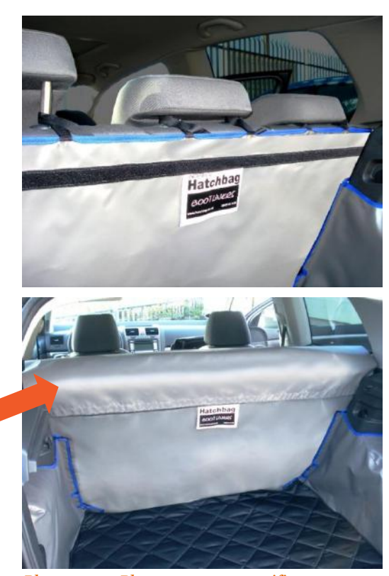
Please note: Photos are non specific to your vehicle