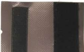
base hook /loop fastener tabs