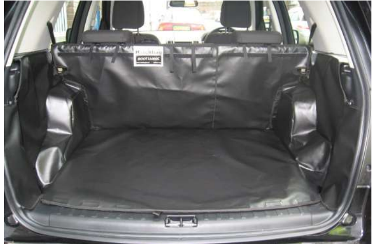
Rear Plus with Seat Split boot liner prepped for a seat flap.