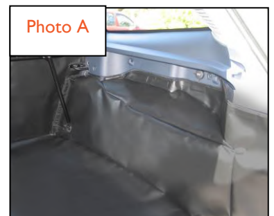
Photo A Shows the Boot Liner specifically designed for a CD multi-changer. It also shows the allowance made for a Dog Guard - You will need to request these modifications when you place your order