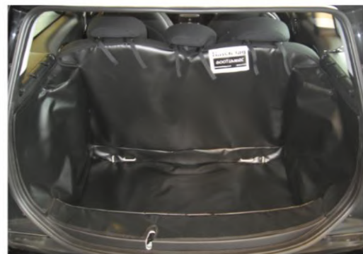
Please note; This photo shows the “LOWERED” Floor version

Minimum of 21 self-adhesive loop fastener tabs