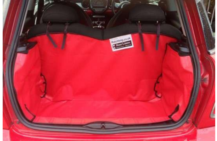
Rear Plus boot liner