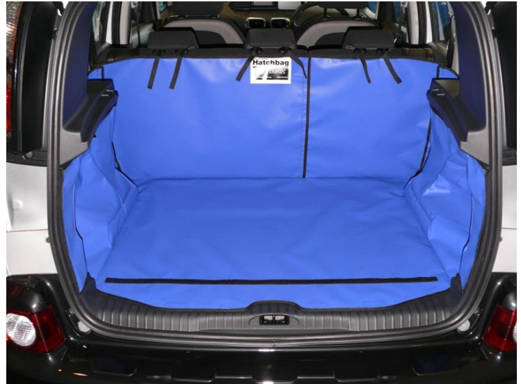
Please note; this shows a Rear Split version False floor in + Row 2 Forward