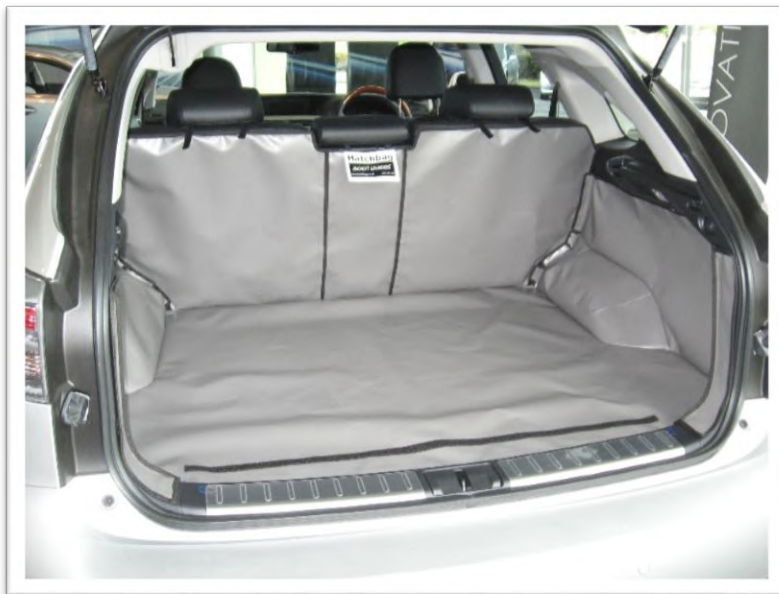
PHOTO: Rear Plus (WITH Seat Split) version prepared for a Bumper Flap

Minimum of 8 self-adhesive loop fastener tabs