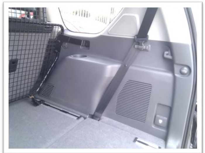
OFFSIDE FLAT VENT PANEL