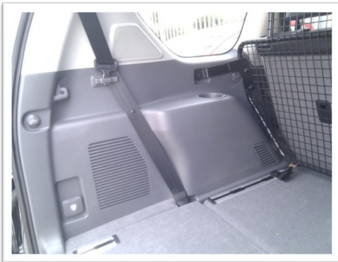
NEAR SIDE FLAT VENT PANEL