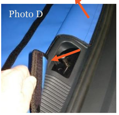
THRESHOLD PLASTIC TRIM