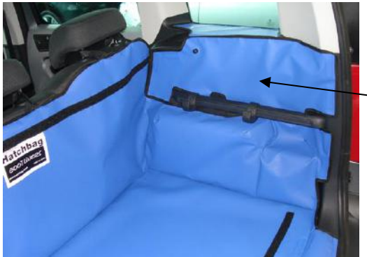
Bar / Storage HOOK system with Window sill flaps fitted