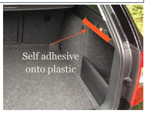
REAR END Self-adhesive loop fastener onto plastic

"RECESS" Model: Section attaches to plastic with long loop fastener strip