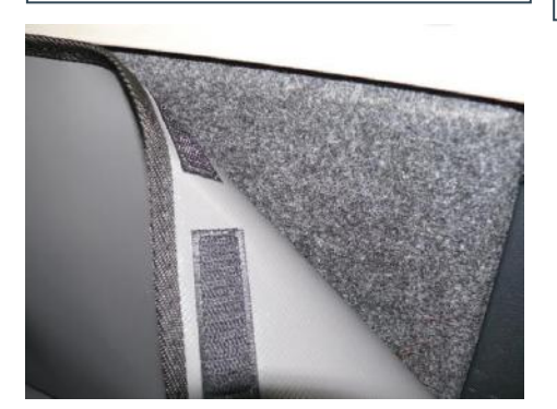
TOP Attaches directly to the carpet

"RECESS" Model: Section attaches to plastic with long loop fastener strip