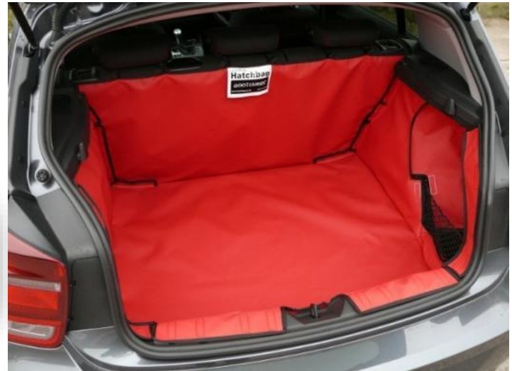
BOOT VERSION: - With “Extended Storage Pack”