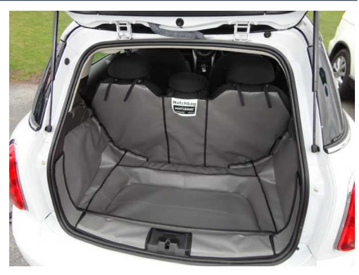
Please note: photo shows the Rear Split version

Minimum of 16 self-adhesive loop fastener tabs