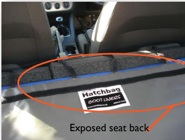
Exposed seat back