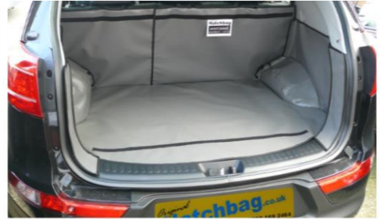
Photo shows a Rear Plus with Seat Split version, prepared for a Bumper and Seat flap