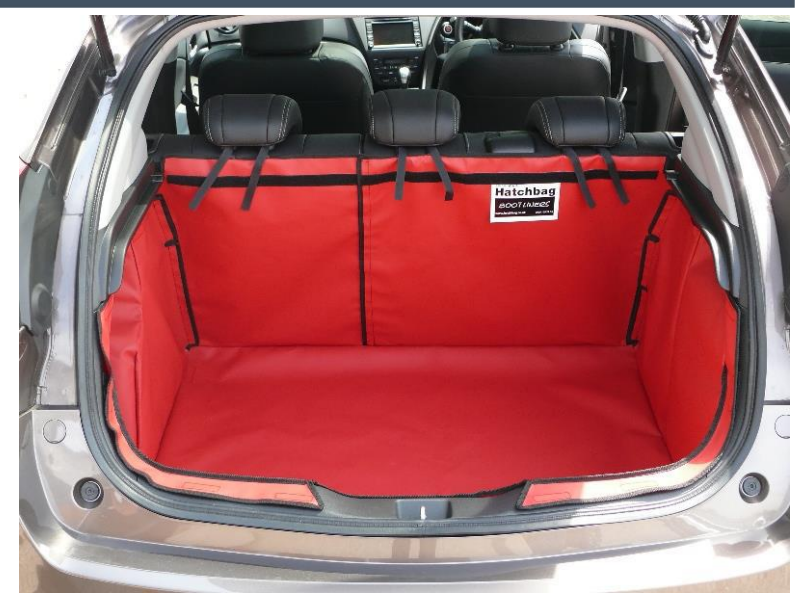
Rear Plus with Seat Split Version, prepared for a seat Flap

Minimum of 17 self-adhesive loop fastener tabs