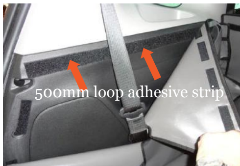
500mm loop adhesive strip