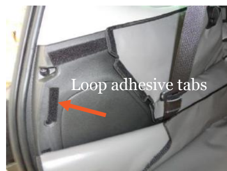
Loop adhesive tabs