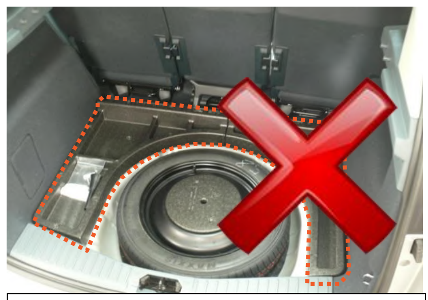
SPARE WHEEL + LARGE Foam Tray