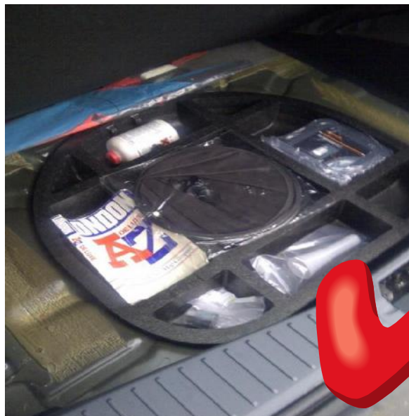
NO spare wheel + SMALL foam compartment