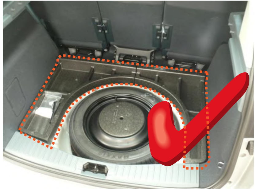
Space saver spare wheel + LARGE foam tray

It does NOT suit just a SMALL foam compartment in the vehicle