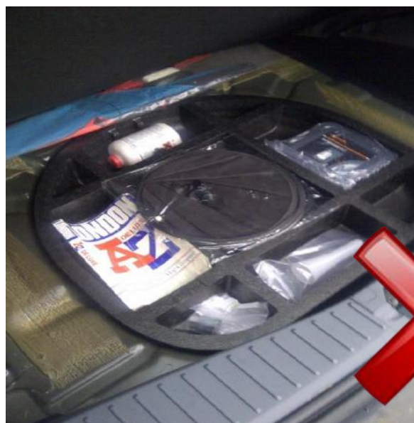
NO spare wheel + SMALL foam compartment

It does NOT suit just a SMALL foam compartment in the vehicle