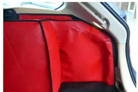
Side attached to the loop fastener