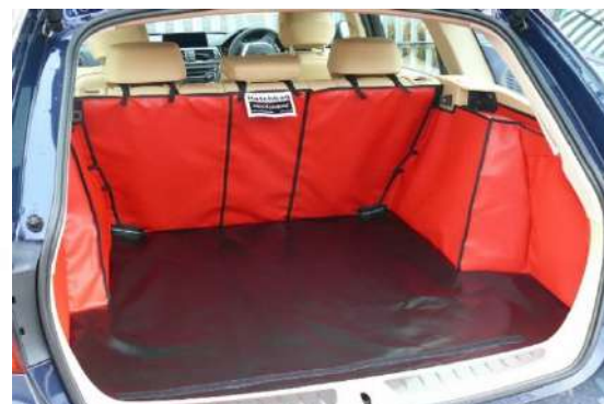
Photo shows "Rear Plus with Seat Split, prepared for a Bumper Flap"