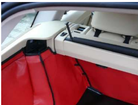
Net Cassette + Load Cover Cassette replaced