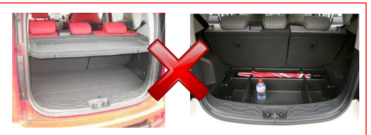
Does NOT suit False Floor

The Boot Liner will NOT accommodate a false floor or storage trays