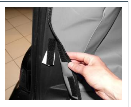
Left + far left; Side views of the Boot liner to suit the Load Cover removed. (The side panels suitable for when the load cover is in place are shorter, leaving access to the screw/mounting points.)