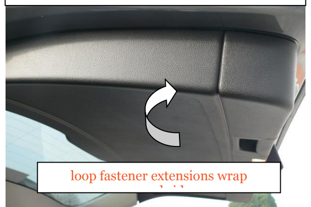
loop fastener extensions wrap