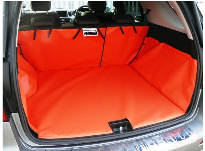
PHOTO: Rear plus with seat split