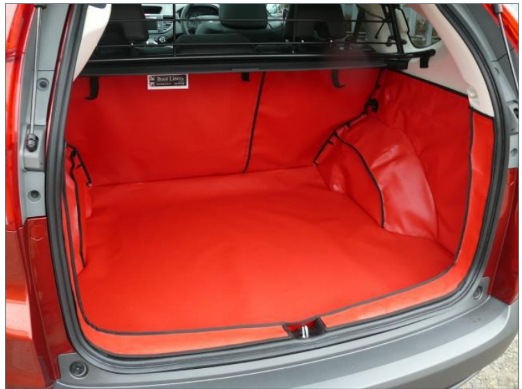
Photo shows a Rear Plus WITH Seat Split version