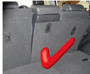
Row 2 Seats almost upright

The Boot Liner will NOT fit correctly if you do not position your seats as above