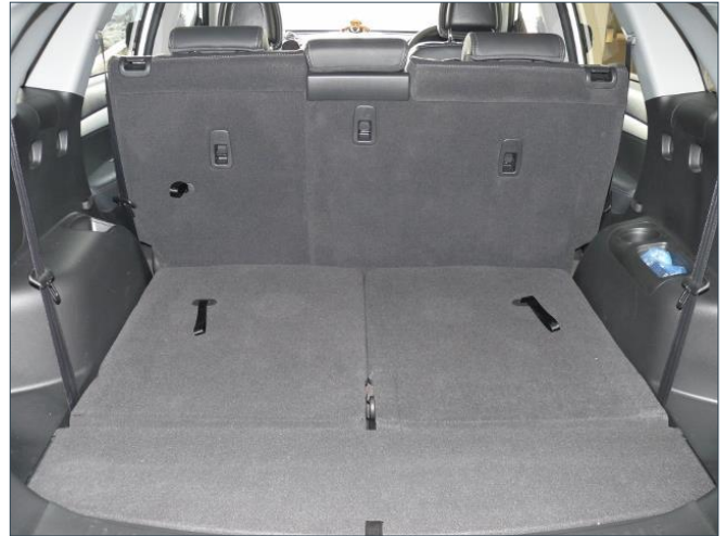
Awaiting Boot Liner photos