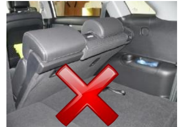
Row 2 Seats reclined