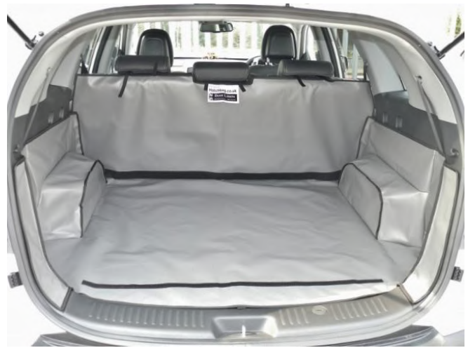
Awaiting Boot Liner photos