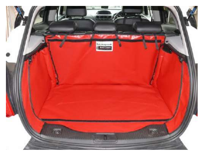
Photo shows Rear Plus version prepared for a Bumper Flap and Seat Flap