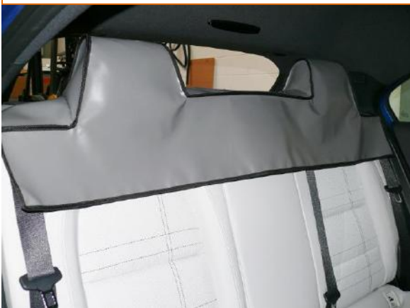
Tailored Seat Flap

PLEASE NOTE: This flap does not suit the Rear Plus Option(s): Flap needs to be removed when rear seats are folded.