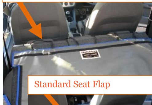
Standard Seat Flap