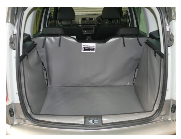
Awaiting boot liner photos

Minimum of 17 self-adhesive loop fastener tabs