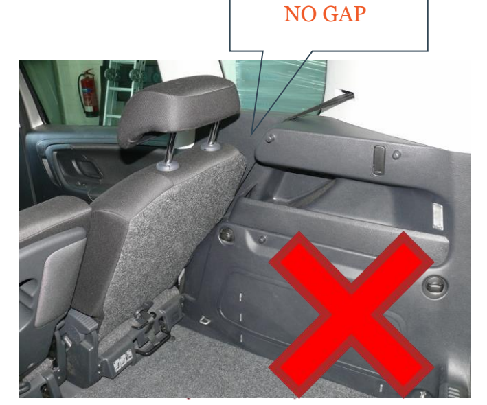
Rear outer seats: Reclined