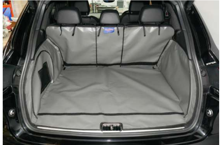
Rear Plus with Seat Split boot liner prepped for a boot liner extension and bumper flap.