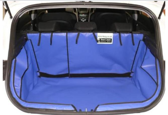
Photo shows Rear Plus WITH Seat Split, prepared for a Boot Liner Extension