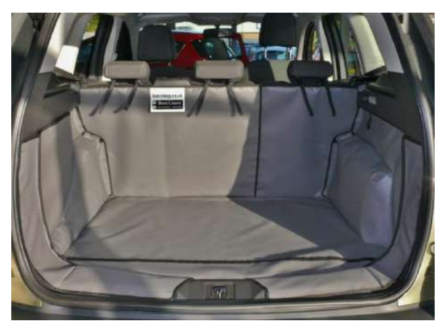
False Floor sitting at its MID level

Packing requirements BOOTLINER 2100mm cut length 30mm wide self-adhesive loop fastener REAR DOOR COVER Minimum of 16 self-adhesive loop fastener tabs