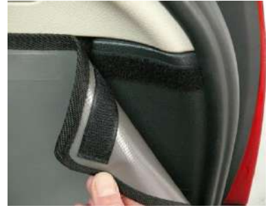
Self-adhesive loop fastener onto plastic