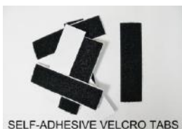
SELF-ADHESIVE VELCRO TABS