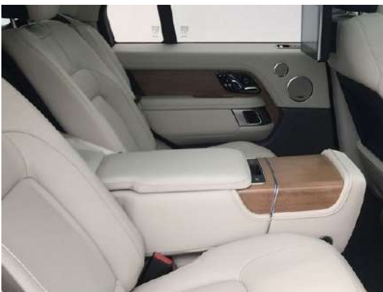
Luxury centre console

The rear seat uppers have an additional rear section The central rear seat belt housing protrudes out of the rear additional section