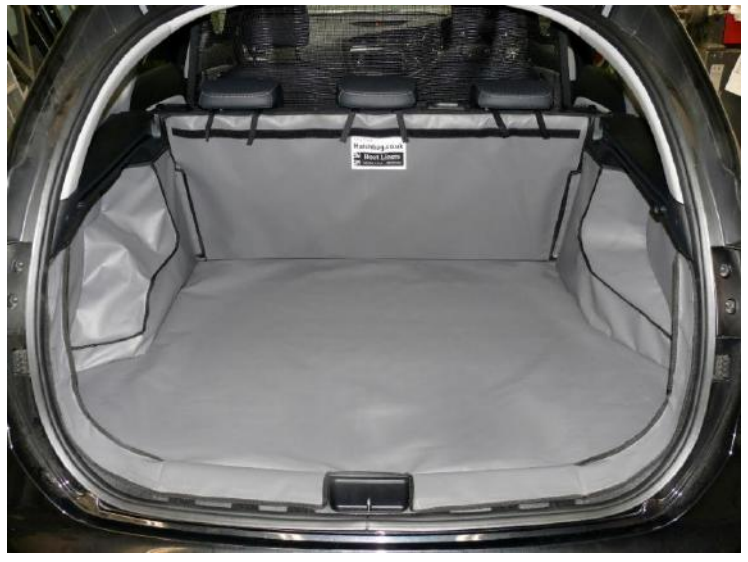
Please note this photo is a Rear Plus version prepared for an additional seat flap