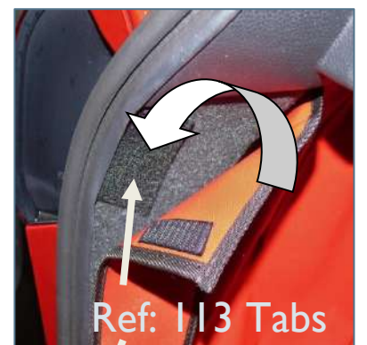
Ref: 113 Tabs