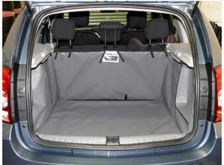
Standard FLOW bootliner

Minimum of 17 self-adhesive loop fastener tabs