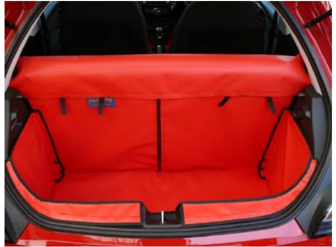
Photo shows a Rear Split and additional seat Flap