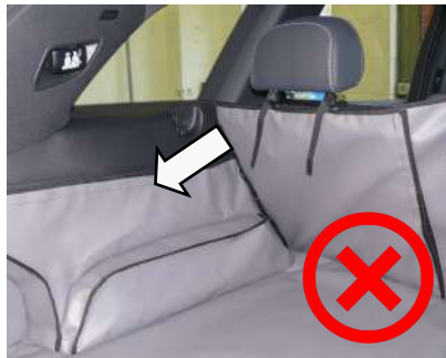
TOO FAR BACK WILL CREASE THE HATCHBAG.