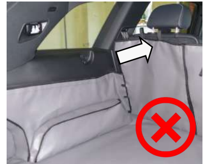
TOO FAR FORWARD WILL PULL HATCHBAG OF THE SEAT.