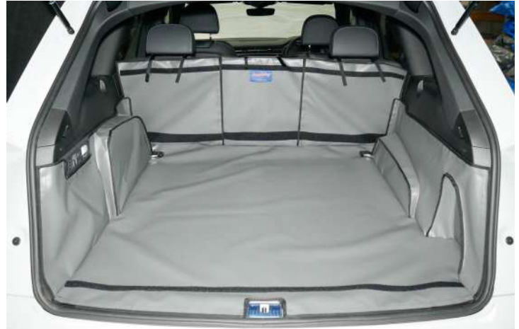
Rear Plus with Seat Split boot liner prepped for a seat flap, boot liner extension and bumper flap.