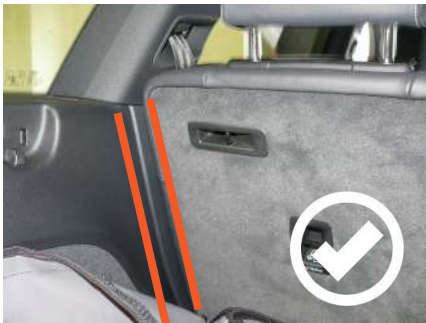
SET THE REAR SEAT RECLINE TO BE PARALLEL WITH SHOWN LINE

Please ensure that the rear seat (2nd row) backs are positioned correctly to suit the liner. The seats should be at a incline parallel to the seam on the car wall (shown below)