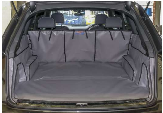
Rear Plus with Seat Split boot liner