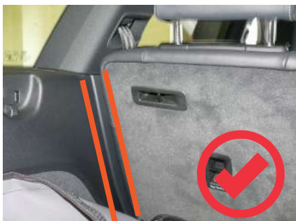
SET THE REAR SEAT RECLINE TO BE PARALLEL WITH SHOWN LINE

Please ensure that the rear seat (2nd row) backs are positioned correctly to suit the liner. The seats should be at a incline parallel to the seam on the car wall (shown below)