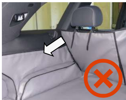
TOO FAR BACK WILL CREASE THE HATCHBAG.