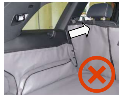
TOO FAR FORWARD WILL PULL HATCHBAG OF THE SEAT.