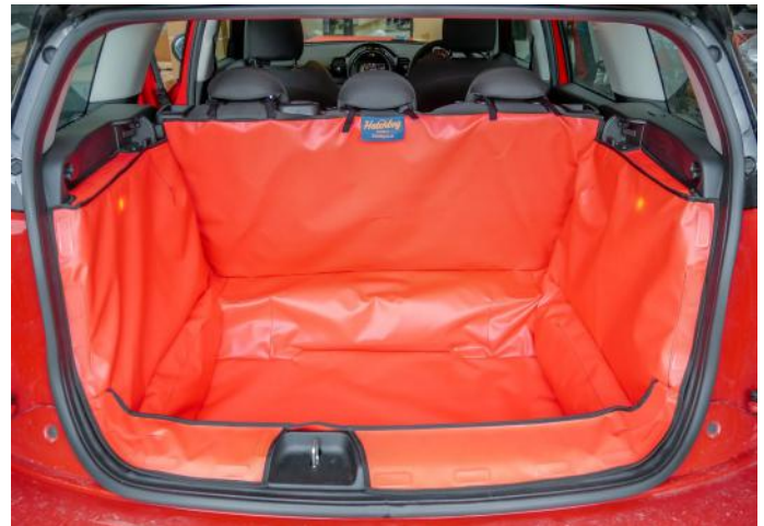
Low-Reclined Split seat version