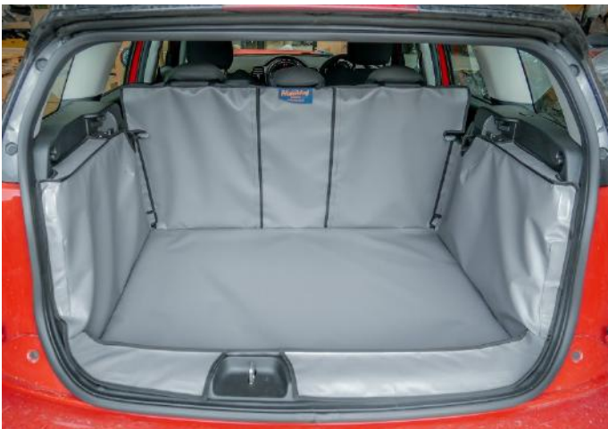
Photo: Raised-Upright Split seat version