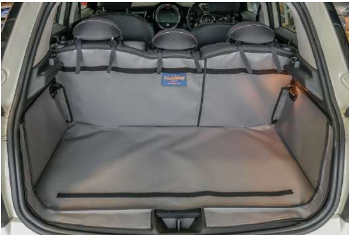
Photo: Raised-Upright Split seat version