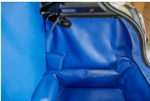
Photo: Low-Reclined Split seat version