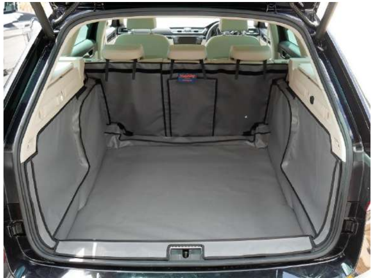
Photo shows Variable floor removed