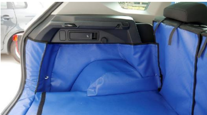
(RAISED FLOOR) PASSENGER SIDE OF BOOT