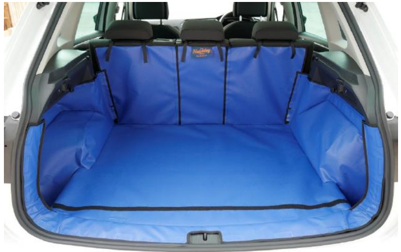
IMAGE ABOVE IS THE RAISED BOOT LINER WITH SEATS RE-