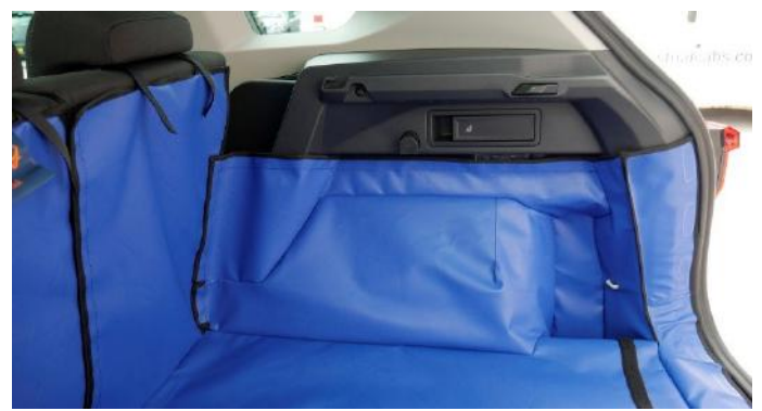
(RAISED FLOOR) DRIVER SIDE OF BOOT