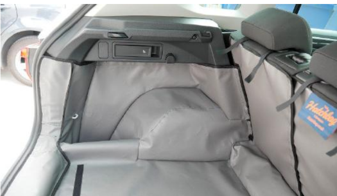
(LOW FLOOR) PASSENGER SIDE OF BOOT