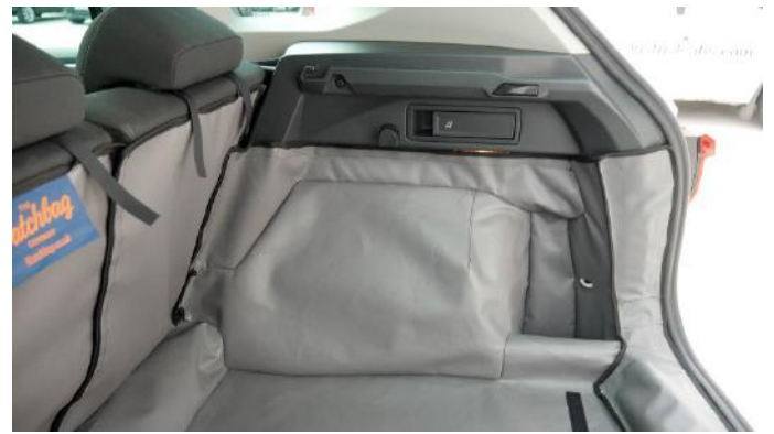
(LOW FLOOR) DRIVER SIDE OF BOOT