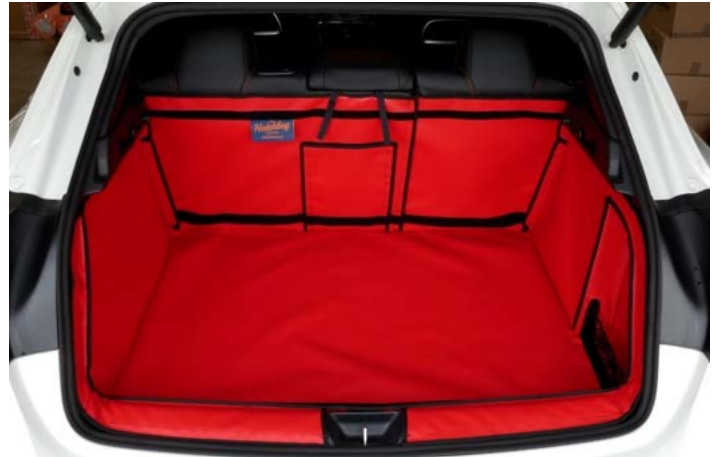
Image above is the Upright Ski Spilt version prepared for a seat flap and Floor extension